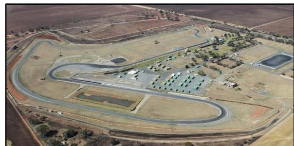
Mallala Motorsport Park