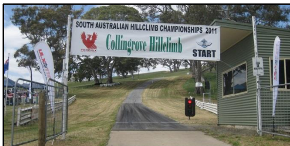
Collingrove Hillclimb Track

The Circuit Excel Association of South Australia manages and promotes Circuit Excel racing in South Australia, with race meetings run under the Sporting Car Club of South Australia's State Motor Racing Championship , governed by Motorsport Australia's Group 3E – Circuit Excel Technical Regulations , with rounds at both Mallala Motorsport Park and The Bend Motorsport Park .