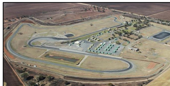
Mallala Motorsport Park