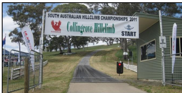
Collingrove Hillclimb Track

The Circuit Excel Association of South Australia manages and promotes Circuit Excel racing in South Australia, with race meetings run under the Sporting Car Club of South Australia's State Motor Racing Championship , governed by CAMS regulations Group 3E – Circuit Excel , with rounds at both Mallala Motorsport Park and The Bend Motorsport Park .